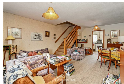
Ground Floor Approx. 352.8 sq. feet